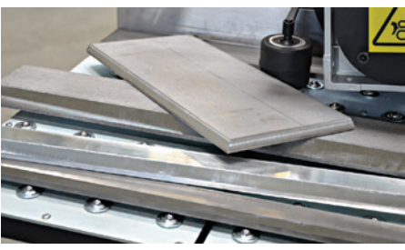
High quality bevel results