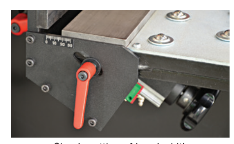
Simple setting of bevel width