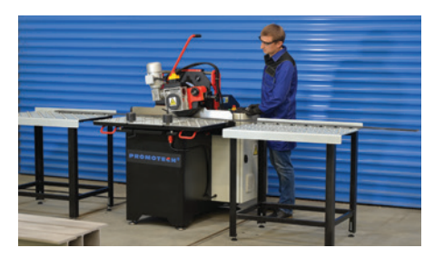
Auxiliary tables to accommodate long workpieces