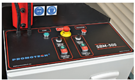
User-friendly control panel