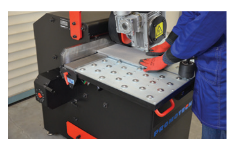
Convenient ball roller bench