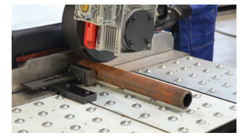
Posibility of pipe OD beveling